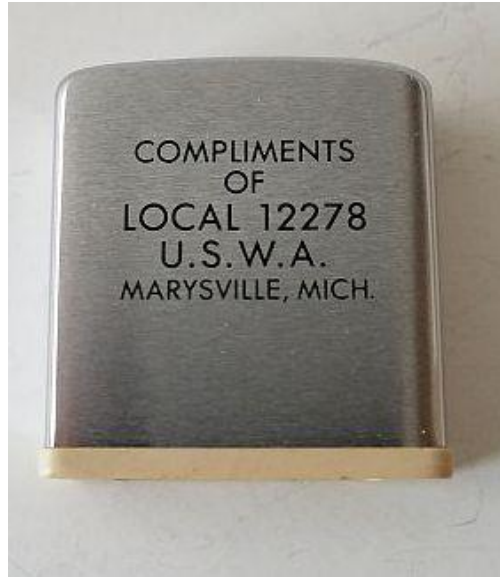
Obverse of match holder