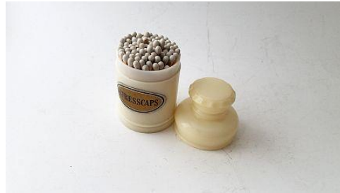
Match holder open