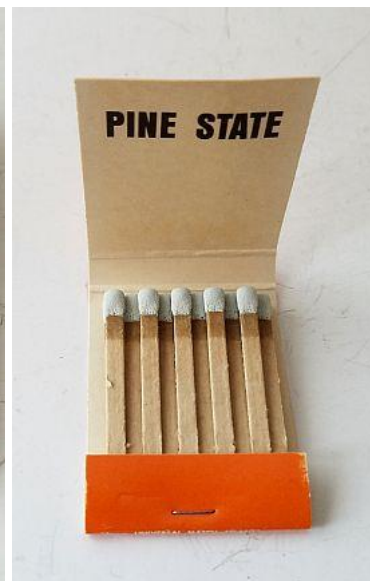
Match book open