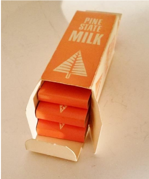
Match books inside holder