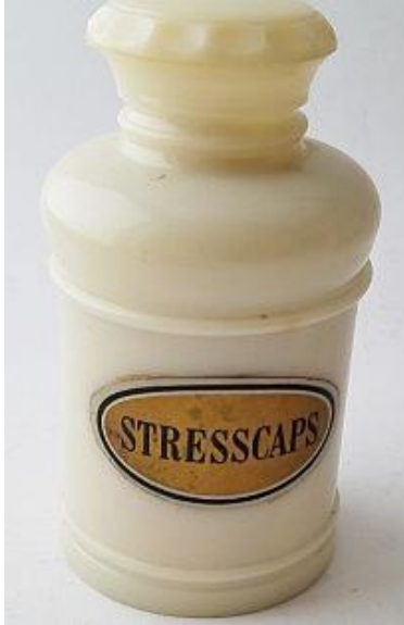
Match holder closed