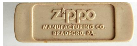
Bottom of match holder

The third match holder is a 3" high plastic container with a pull off cap that has fiction matches stored within. A roughened piece of sandpaper in on the bottom of the container to allow the match to be ignited. The label on the front reads, STRESSCAPS. This match holder came from a 1950s dentist office where its intended purpose was to encourage cigarette smoking to ease dental anxiety.