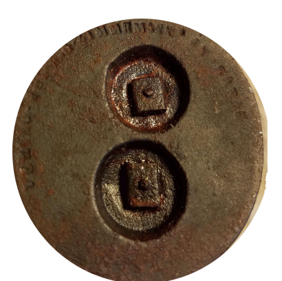
Zimmermann mark on top

The holder on the left, by the unknown maker, obviously, has no pipe, but does have an opening in the crook of his left arm to hold a match. The holder on the right has a pipe with an open bowl that can easily accommodate a match. Why the differences between the two holders?