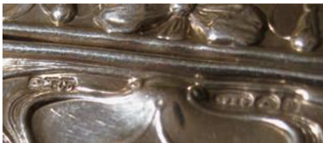
Marks for imported plate

Another Gorham safe B1300 has similar marks (although with a 1904 date mark):