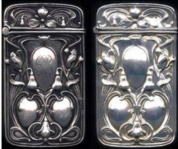
American version on left.