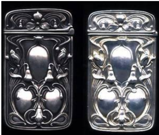
Obverse sides, American version on left