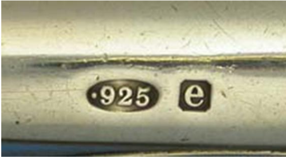
(Photographs of B1300 courtesy of George Sparacio)

To date, researchers have found nine Gorham match safes that have the patented 1910 spring. They are production numbers B2149, B2148, B2198, B2511, B3175, B3803, B3804, B3805, and B3989. Below is a copy of the patent issued to J.E. Pender, a silversmith and foreman at Gorham.