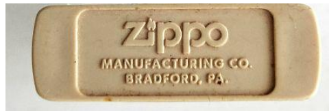
Bottom of match holder

The third match holder is a 3" high plastic container with a pull off cap that has fiction matches stored within. A roughened piece of sandpaper in on the bottom of the container to allow the match to be ignited. The label on the front reads, STRESSCAPS. This match holder came from a 1950s dentist office where its intended purpose was to encourage cigarette smoking to ease dental anxiety.